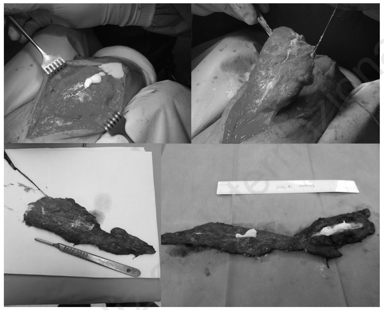
Figure 2 - Intraoperatively picture showing the masses' resection. The masses were located intramuscularly, extending through the whole length of the lateral triceps'head bilaterally.