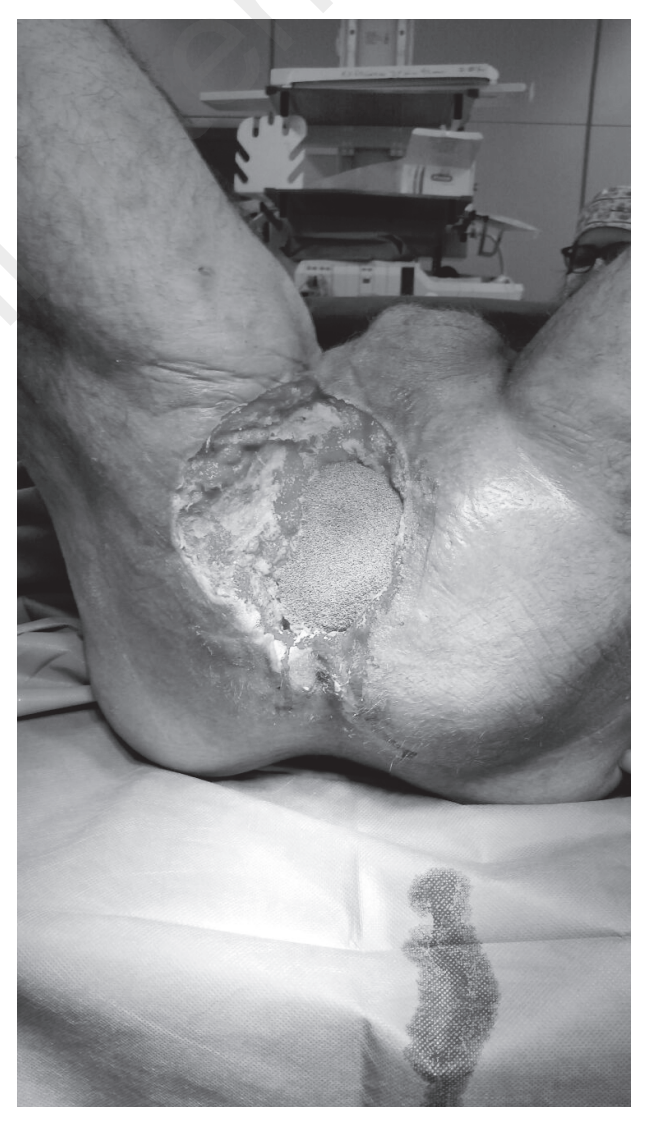
Figure 2 - Post-operative abdominal perineal resection wound with NPWT.

The patient was discharged 7 weeks after surgical pro-