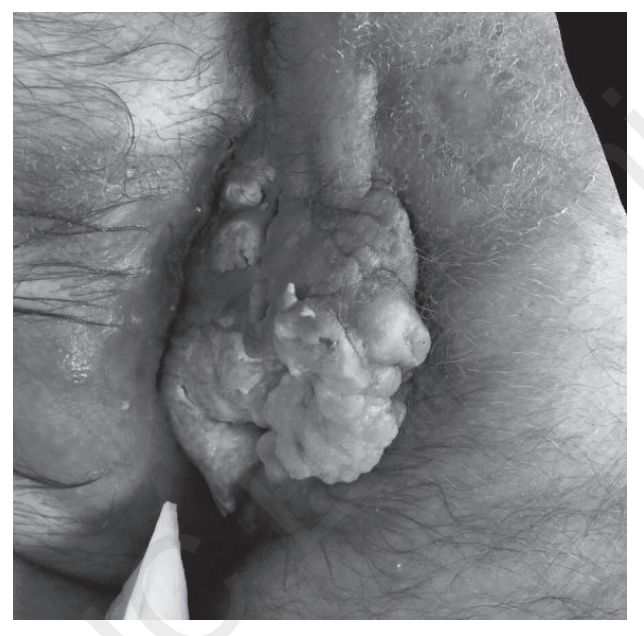
Figure 1 - Partially ulcerated, cauliflower-like tumor.

Our first approach was a left laparoscopic loop colostomy for a fecal diversion and antalgic purpose, while the perineal mass was biopsied. Histology of the biopsy showed "massive epidermal hyperplasia, hyperkeratosis, atypical koilocytosis and low grade dysplasia". Therefore, the patient underwent a complete excision of the perianal neoplasm. On the whole specimen a well differentiated squamous cell carcinoma was identified, and therefore a radicalization of the surgical procedure was planned.