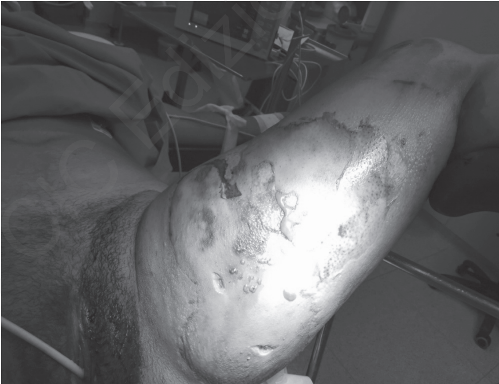
Figure 1 - Necrotizing fasciitis of the left thigh in a 51 years old woman. Cultures revealed A streptococcus pyogenes and the histological examination G(+) cells and diversion in high malignancy B cell lymphoma.

Necrotizing fasciitis was first described "in modern time" by a confederate Army surgeon, Josef Jones. In 1871, during the US civil war, he reported 2642 cases