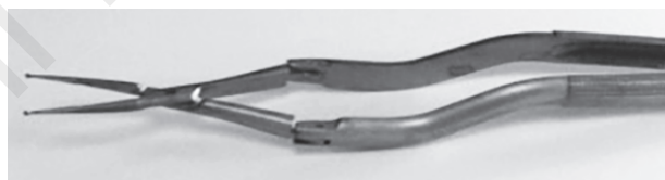
Figure 1 - Forceps in titanium alloy.

We have now utilized them several times during vascular, spinal and brain micro-surgery and we have found