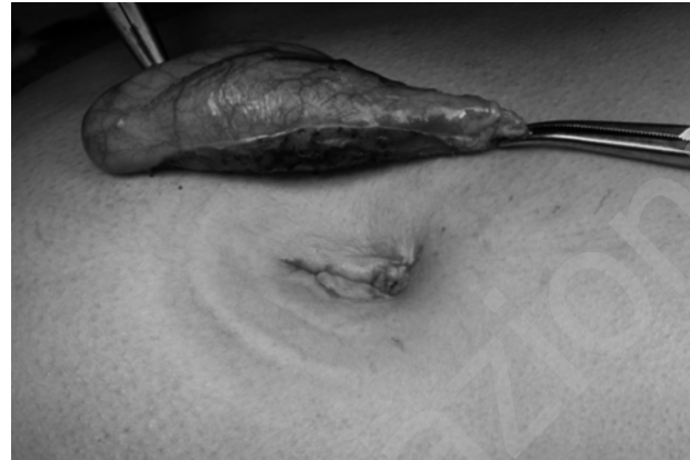
Fig. 1 - Umbilical scar with intradermal suture.

The patients began taking small quantities of fluid a few hours after surgery and could eat the following day. All patients were discharged with the prescription of low molecular weight heparin (LMWH) for prevention of thromboembolic disease.