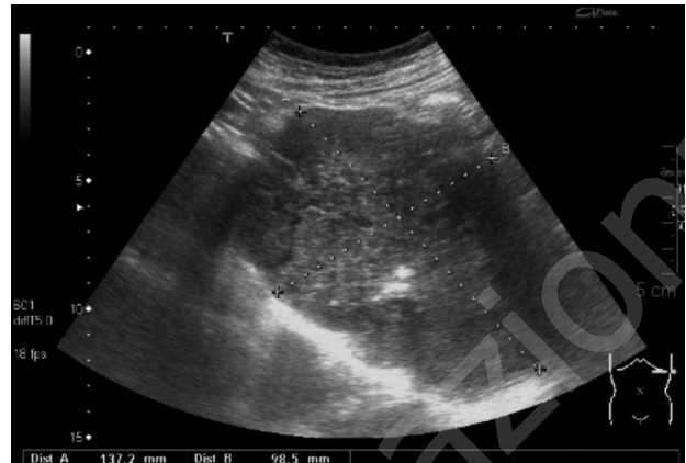
Fig. 1 - Ultrasounds showed an oval and heterogeneous mass of 13x10 cm in the left hypochondrium.

Surgical resection with negative margins without lymphadenectomy has been the treatment of choice of gastric GISTs up to now (14). Histologically, a 1 to 2 cm margin has been thought to be necessary for adequate resection (15,16). Simple wedge resection, when feasible, has become the recommended surgical approach in the gastric GISTs, because it carries a lower risk of com-