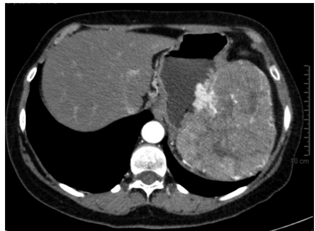
Fig. 3 - Contrast-enhanced CT image: inhomogeneous, extraluminal, tumor mass with irregular shape.