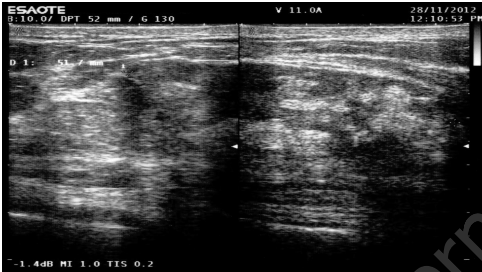
Figure 1 - Ultrasound. The lesion is well-capsulated.