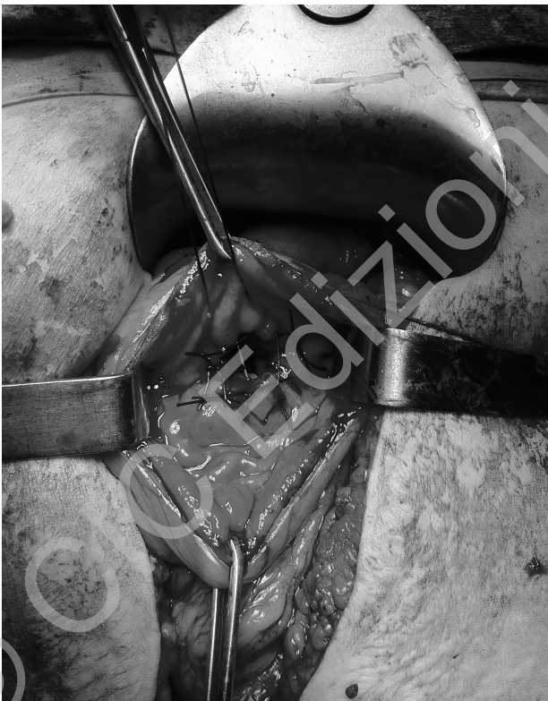
Fig. 2 - Internal derivation of the cyst with the posterior wall of the gastric antrum (cystogastrostomy).

necrotic debris, blood degradation products and pancreatic juice. They are a delayed complication of acute or chronic pancreatitis or, rarely, pancreatic trauma.