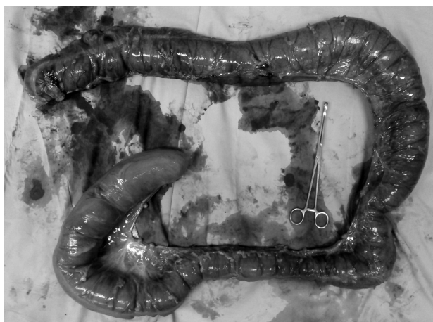
Fig. 4 - Total colectomy specimen (length: 230 cm; max diameter: 13 cm).

nic flexures act to fix the transverse colon in position. The chronic constipation is a common condition which predisposes to volvulus because of the elongation and the redundancy of the colon. This situation permits volvulus even in the presence of a normal mesentery (8). The presence of simultaneous volvulus in the transverse colon and in another colonic area is an extremely rare situation. It seems that dolichocolon is a clinical condition involving elongation and dilatation of the colon, most commonly seen in elderly patients, as in our case (9). Re-