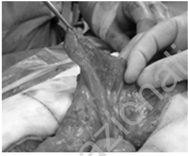
Fig. 2 - Intraoperative picture of a diverticulum causing bowel intussusception on the Roux loop.

Cast, stones and sludge complicate about 6% of OLTs in the largest series, being associated mostly with anastomotic or non-anastomotic strictures (1, 2). All factors causing increased bile viscosity, reduced flow and biliary epithelial damage can be responsible for precipitation of lithogenic materials, but pathogenic mechanisms have not yet been exactly clarified. A wide range of risk factors have been hypothesized, including the presence of