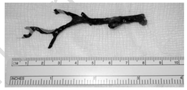
Fig. 3 - Picture of the extracted cast.

stents or T-tube, hepaticojejunostomy, ischaemia, hemobilia and infections (3). As in this case, they can also develop secondarily to bile stasis caused by functional or anatomical problems of the efferent jejunal loop (4). Casts can be asymptomatic or they can act as a focus of infection and result in recurrent cholangitis. Surgical or interventional radiologic treatments can be performed, but the outcome is associated with a worse prognosis, with a 10% mortality rate (5).