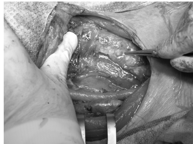
Fig. 1 - Operative field after complete exeresis: the tumour was "shaved off" from the trachea and removed with an oval of oesophageal wall; right LRN had already been paralyzed and was resected.