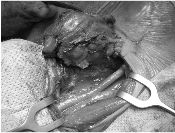
Fig. 2 - The elements of right vascular bundle have been dissected from the tumour.

pic residual disease was left behind in 7 cases (R2 resections: 35%) because an aggressive resection of infiltrated vital structures was not considered reasonable (5). The operation ended with a tracheostomy in one case.