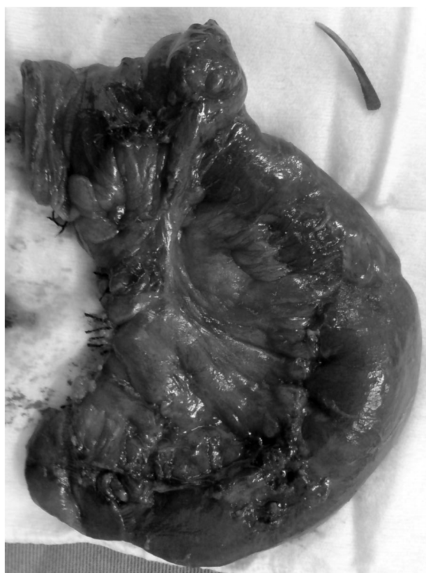
Fig. 2 - Gross specimen.

Meckel's diverticulum (MD) is the most common congenital abnormality of the small intestine and corresponds to a remnant of the vitelline duct which nor-