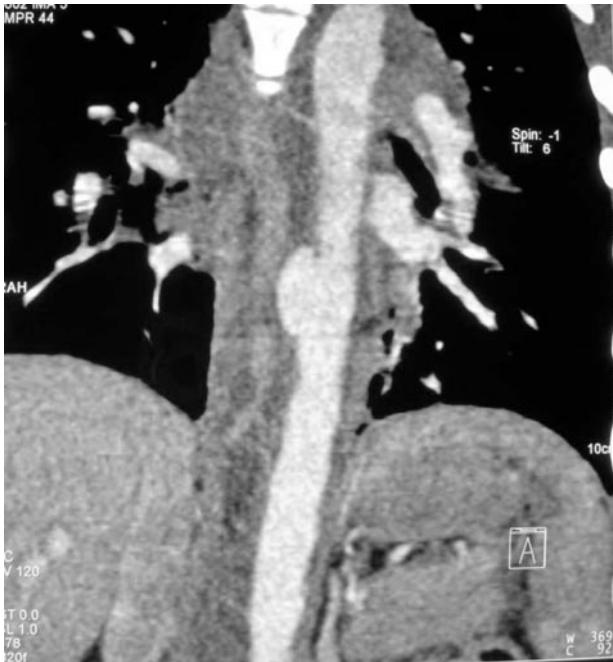
Fig. 1 - CT scan: rupture of retrocardiac thoracic aorta.

We took urgently the patient to operatory room. We performed a catheterization of right femoral artery and left brachial artery. The arteriography confirmed a retrocardiac rupture of thoracic aorta and a little ostial dissection of brachiocephalic trunk. We positioned Cook Zenith device (24-24 mm of diameter and 10 mm of length) in the side of rupture by surgical access of left femoral artery. The postprocedure angiography showed a perfect repair of thoracic aorta (Fig. 2).