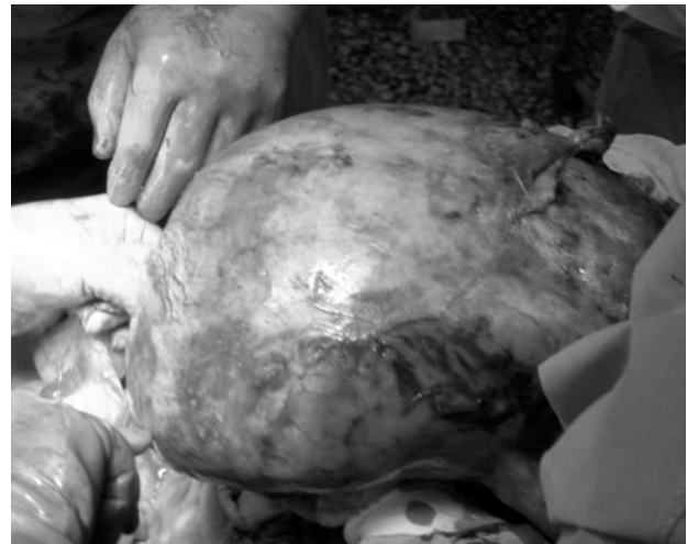
Fig. 5 - Excision of the desmoid tumor.