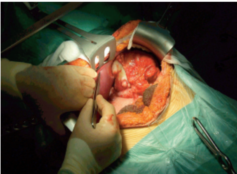
Fig. 2 - Laparotomy showing the mass infiltrating the stomach and the liver.

First described by Gerald and Rosai (6), DRSCT has distinct clinical, histological and polyphenotypic immunohistochemical features (7-9). The distinctive pathological finding of DRSCT is a nesting pattern of cellular growth within dense desmoplastic stroma and immunohistochemical coexpression of epithelial, muscle and neural markers (6, 8, 10). Genetic expression observed consistently in DRSCT reveals a unique reciprocal translocation - (t11;22)(p13;q11 or q12) - as