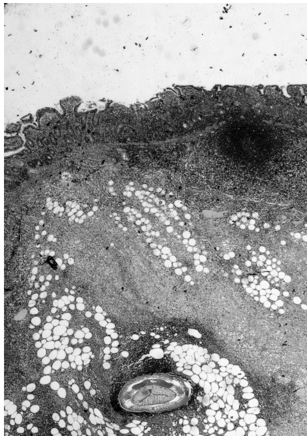
Fig. 2 - A cross-section of Anisakis in the intestinal submucosa under high resolution (H&E stain; original magnification x10).

With physical, laboratory and radiological findings suggesting an acute appendicitis, a surgical procedure by McBurney's incision was planned. During the surgical exploration, a strongly-suspected neoplastic lesion of the caecum was detected. The caecum was dilated with edematous, inflamed and thickened walls. Therefore a midline laparotomy was performed, followed by a right colectomy with hand-sewn, single-layer, end-to-end ileo-